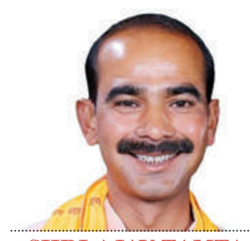
SHRI AJAY TAMTA Minister of State for textiles